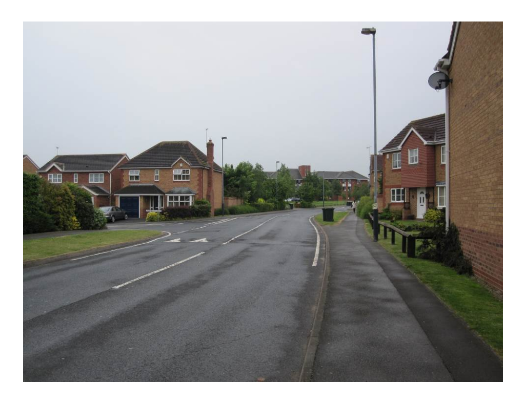
Recent housing development typical of the southern half of the character area