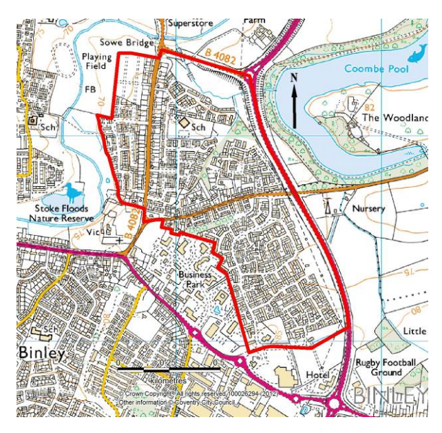
Registered Parks and Gardens: 0