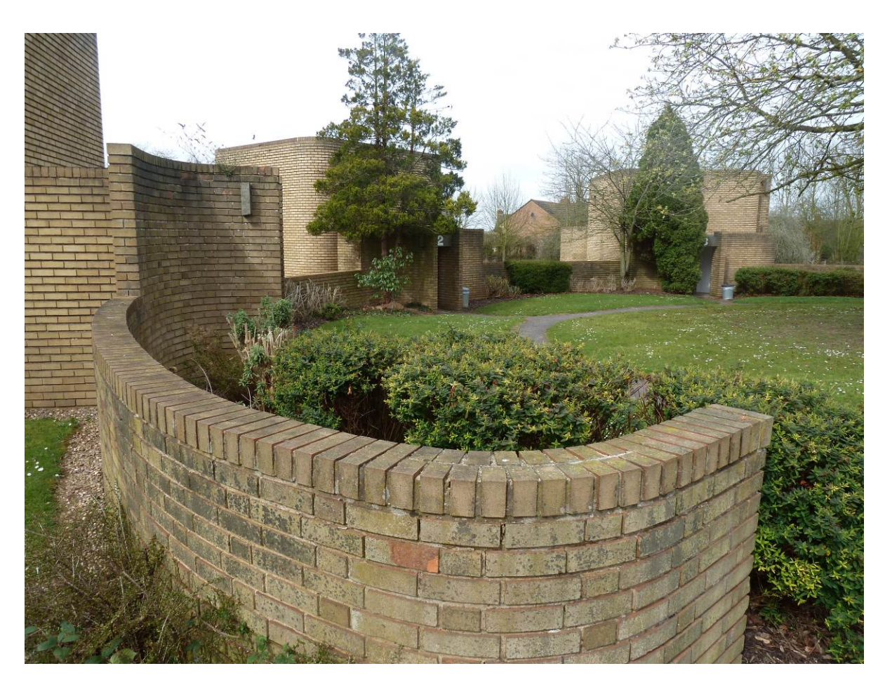
University of Warwick's Grade II Listed Houses for Visiting Mathematicians.