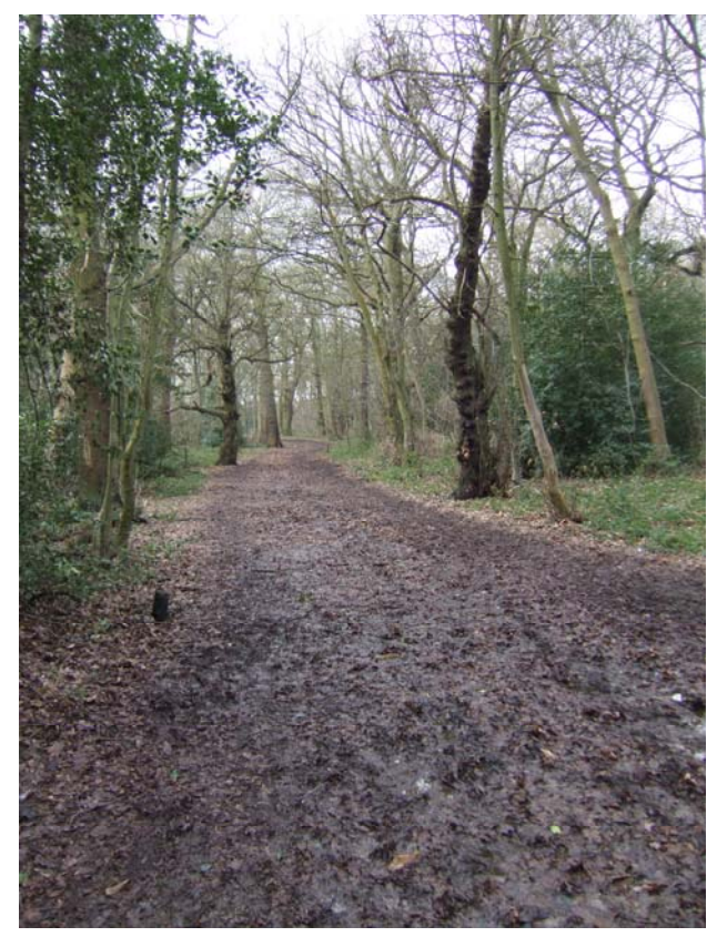
Park Wood ancient woodland

Park Wood and Ten Shilling Wood have been in existence since at least 1597 and are classified as areas of Ancient Woodland. At this time the west part of Park Wood was called Commaunders Cops and the east was known as Hanckornes Cops. The current boundaries of Park Wood are the same as the 16<sup>th</sup> century perimeter. The field located between the two areas of woodland was also in existence in 1597 and called Ten Shilling Close.