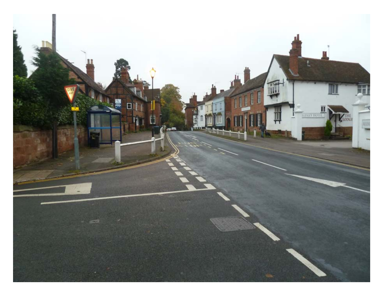
A view of Allesley Village along Birmingham Road