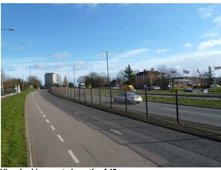
View looking east along the A45