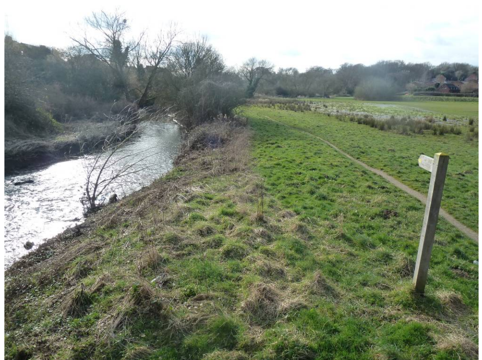
Open green space along the Sowe Valley footpath

football pitches, tennis courts, bowling greens and allotment gardens. The length of the Character Area can be accessed by the Sowe Valley Footpath. Despite being an area of large, open, green space, this is an area of great activity due to the proximity of residential areas, including schools, and access to popular leisure facilities.