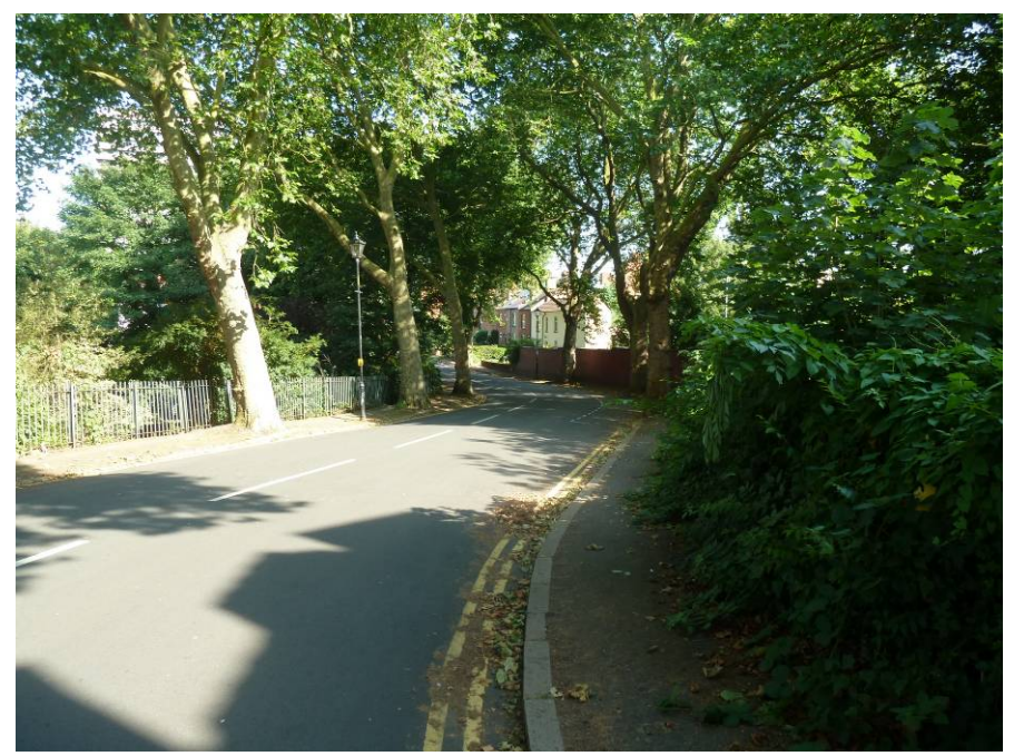
Middleborough Road near Naul's Mill Park.

In general, this Character Area comprises of dense housing with little provision for green space in the residential areas. This area is well served with amenities including many of schools, shops, places of worship and sports grounds.