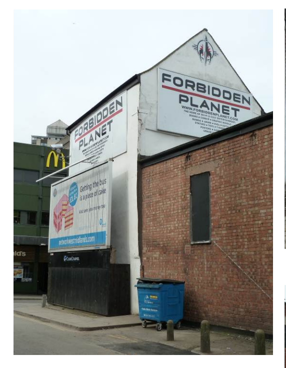
Unsympathetic boundary treatments

The environment in Palmer Lane is very poor with varying boundary treatments, surface treatments, graffiti, a disused building, intrusive signage and many large refuse containers. These combine to degrade the special and historic character of the Conservation Area and damage the important view of the River Sherbourne and the roofscape of the Burges properties.