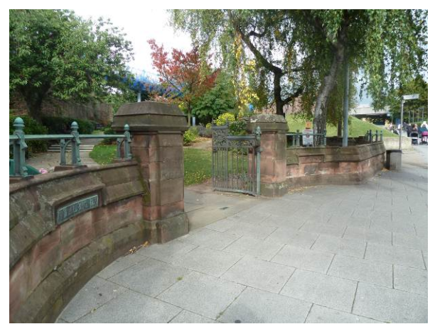
Boundary wall, railings and gates at the Southern entrance to Lady Herbert's Garden