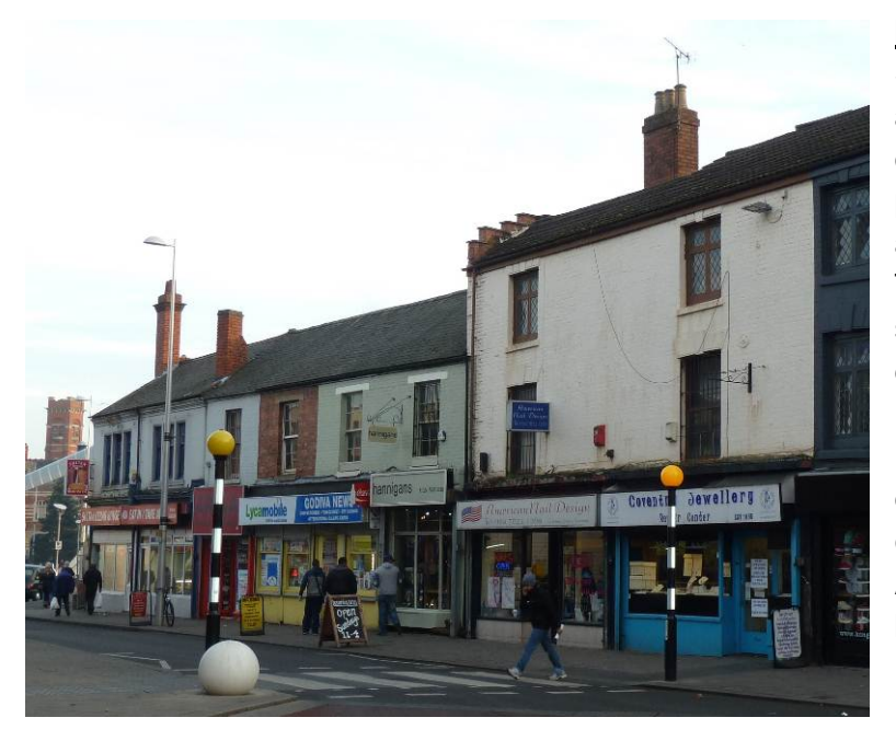
Examples of poor shop fronts, projecting signs and A-boards in Hales Street

The Council will ensure that future changes to shop fronts, fascia and projecting signs, and A-boards are of high quality design and use appropriate materials, colours and scale, in order to enhance individual historic buildings and the overall appearance of the Conservation Area.