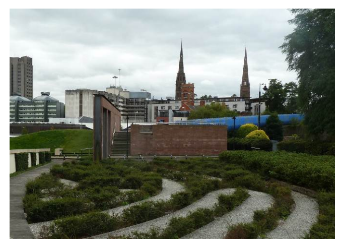
Sandstone used in the design of the Garden of International Friendship, which complements the medieval City wall and gates and the wall surrounding Lady Herbert's Garden

Some recent developments have been carefully designed to enhance the area and complement existing historic buildings. This approach should continue to be used for all future developments including any development that may take place on the temporary 'pocket parks' in Hales Street and at the corner of Bishop Street and Corporation Street.