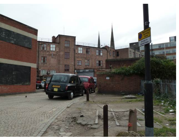
A general view of Palmer Lane

Changes to existing boundary treatments, surface treatments and signage that enhance the historic character of Palmer Lane, views of the River Sherbourne and the rear of The Burges will be supported. Development proposals that involve de-culverting to reveal the River Sherbourne in this area will be supported.