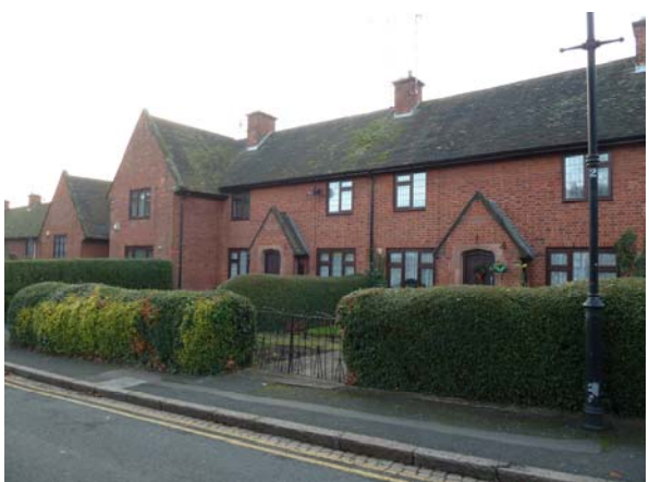
Hedge boundaries in Chauntry Place

The removal of any boundary walls or railings that contribute to the character and appearance of the Conservation Area will not be permitted. Hedges should be retained where they contribute to the character of the Area and re-instated where opportunities allow. Any new fencing must enhance the Area.