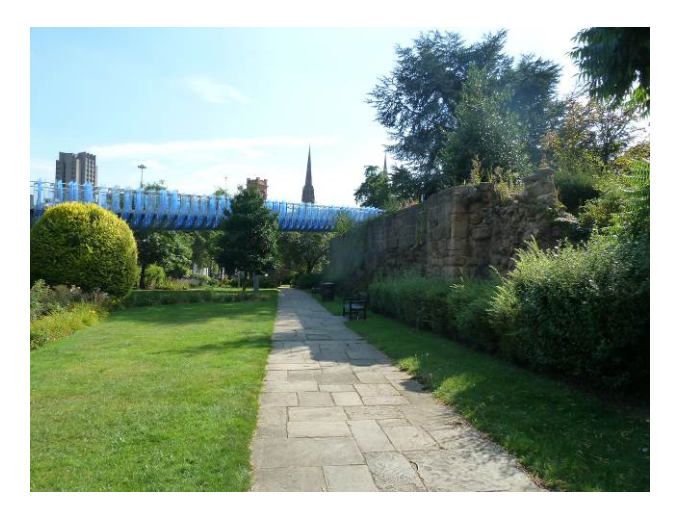
York stone paving in Lady Herbert's Garden

The paved and cobbled surfaces that are present throughout much of the Conservation Area greatly enhance its character and provide an appropriate setting for its buildings and structures.