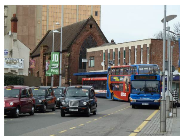
The view of the Old Grammar School along Hales Street

There are many important views and vistas within and looking into the Conservation Area that should be maintained. There are also some views that could be greatly enhanced, for example the view along Hales Street towards the Old Grammar School. The view of the east window of the historic building is obscured by No. 4 Hales Street and the view of the street is spoiled by the poorly designed and unattractive buildings on the north side. Another example is the view of the rear of the Burges which could be enhanced by making improvements to Palmer Lane (see 3.6).