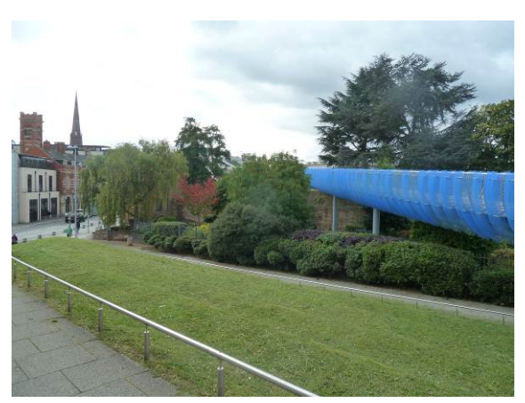
View towards Lady Herbert's Garden, the Old Fire Station on Hales Street, and the spire of St. Michael's