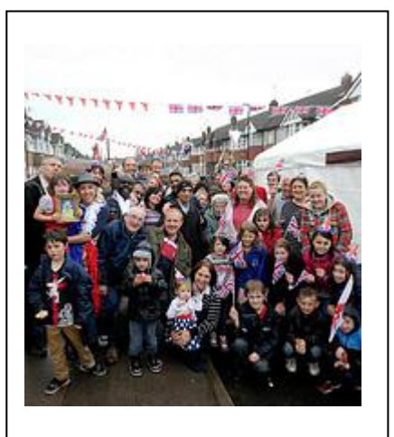
Jubilee street party in Silverdale Road

There are 10 ways that have been identified to help Coventry residents to improve their mental wellbeing. Through working with communities to understand their strengths, we will work together to support communities