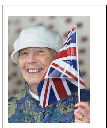
Celebrating the Jubilee

As people age, they are more likely to develop physical and mental health conditions. Physical illnesses such as diabetes, heart disease, arthritis, respiratory diseases and sensory impairments (such as loss of sight or hearing) are often combined with declining mental health, such as dementia. This has an impact on families, especially carers, as well as the affected individuals. Older people – those over retirement age – may suffer deteriorating mental and physical health due to poor housing, poverty, lack of access to transport and experience of, or fear of, crime.