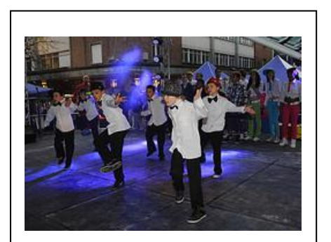
'Titanz' performing at Coventry Christmas Cracker

We will encourage breastfeeding and give support and advice on how and when different foods should be introduced.