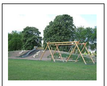
Holbrookes play area

At an early stage of pregnancy their weight and physical activity will be discussed with them, and support given if necessary.