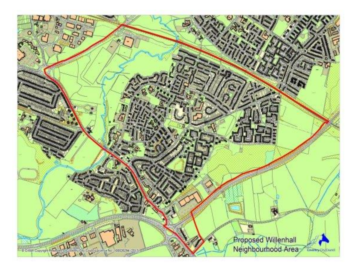
Diagram 1 – The Willenhall Neighbourhood Area

2.9 The Willenhall Neighbourhood Planning Group was then approved by the City Council as the appropriate qualifying body on 6 February 2014.