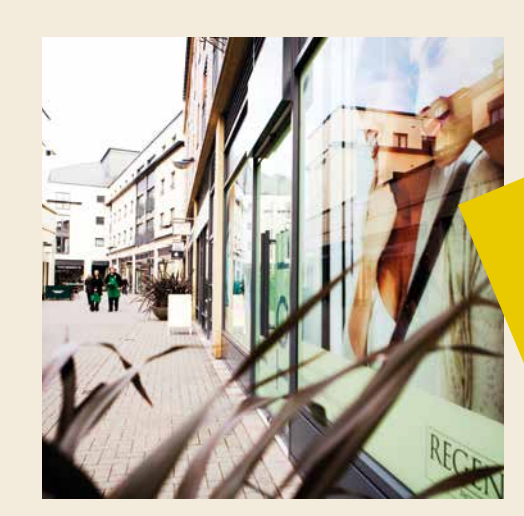
Leamington Parade, Leamington Spa, Warwickshire

*Coventry data from STEAM 2021 *Warwickshire data sourced rom "Tourism Economic Impact Assessment" 2021, prepared by The Research Solution (TRS)