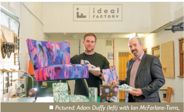
a Business Growth Adviser at the University of Warwick Science Park,

A Warwickshire entrepreneur, who grew up wanting to 'design trainers for Nike', is growing his own cool design and manufacturing studio in Coventry after receiving business support.