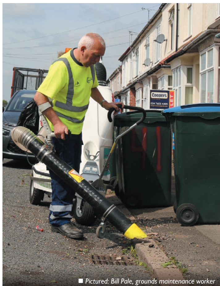
a bin. It then relies on resider