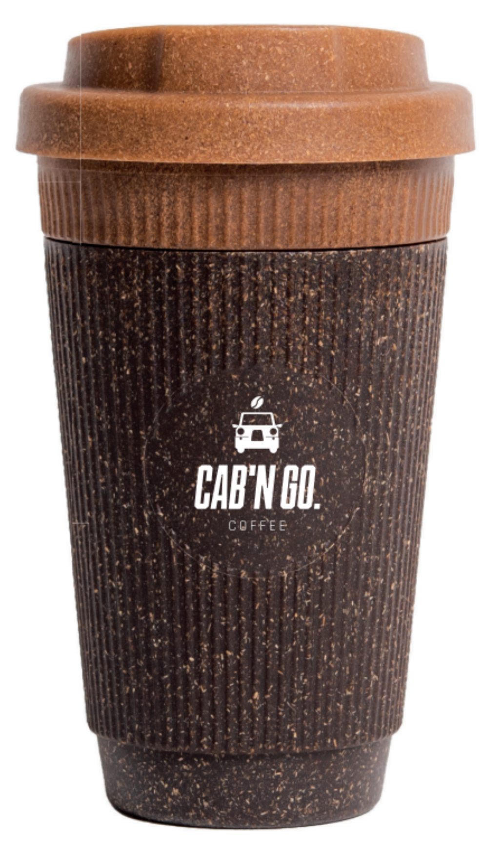
This cup is made out of coffee beans and wood.