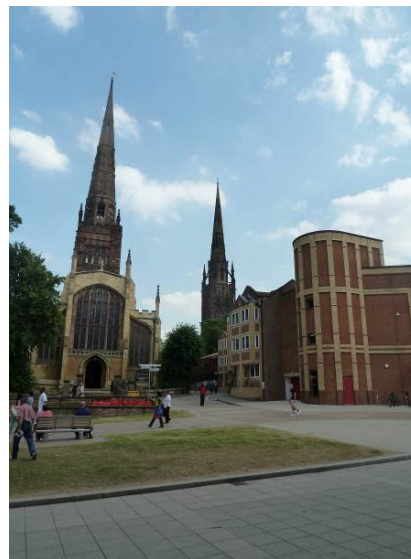
The Spires from Broadgate

There are many important views and vistas within and looking into the Conservation Area that should be maintained. The spires of the Cathedral and Holy Trinity are the focal point of the city centre and are visible from across Coventry and beyond giving Hill Top a setting which is far broader than any other Conservation Area in Coventry.