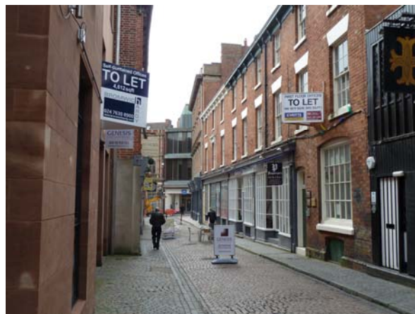
Vacant properties in Hay Lane

Several buildings which make a positive contribution to the Conservation Area are currently empty and there is a risk that their condition will deteriorate.