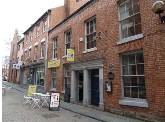
The use of a canvas banner and modern A-boards detract from the historic character of Hay Lane

Signage and advertising have a major impact on the appearance of particular parts of the Conservation Area and individual historic buildings. Within the Conservation Area there are some examples of signage that is poorly designed and which uses inappropriate materials, colour schemes or lighting. This is damaging to the historic character of the Conservation Area and individual historic buildings.