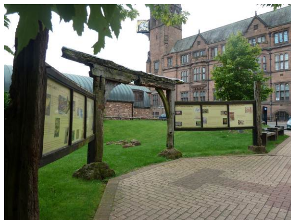
Interpretive panels in open space at Bayley Lane

Heritage interpretation for particular features of the Conservation Area should contribute to peoples' enjoyment of it and increase awareness about its unique history. The interpretation of the archaeological remains in Priory Gardens, the Priory Undercrofts and the Cathedral ruins is often poor. For example, there is no on-site interpretation in these areas that provides the visitor with an overall picture their history and how they relate to each other. The information panels in Priory Gardens provide information about specific areas of the excavated remains of the Benedictine Cathedral but rely on people having been to the Priory Visitor Centre first to find out about its history and yet there are no signs directing people to the visitor centre when they arrive at the garden. The panels in the Cathedral ruins have a dilapidated appearance, are faded and difficult to read. The panels in Bayley Lane do provide the story of how this area has changed over time but they are also somewhat faded and need renewing.