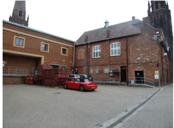
Parking and service area to the rear of County Hall, Pepper Lane

There are several locations within or immediately adjacent to the Conservation Area like Pepper Lane or New Buildings where service yards with bins, plant and poorly positioned car parks have a negative impact on the Area and its setting.