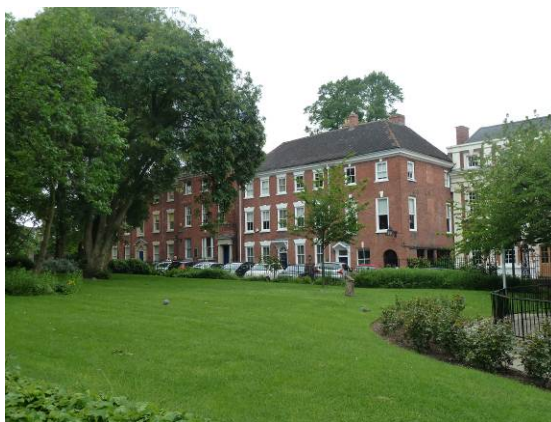
Unity Garden and nos. 6-10 Priory Row beyond

There are a number of green spaces within the Conservation Area that contribute to its tranquil atmosphere as well as enhancing views and providing an attractive setting for historic buildings.