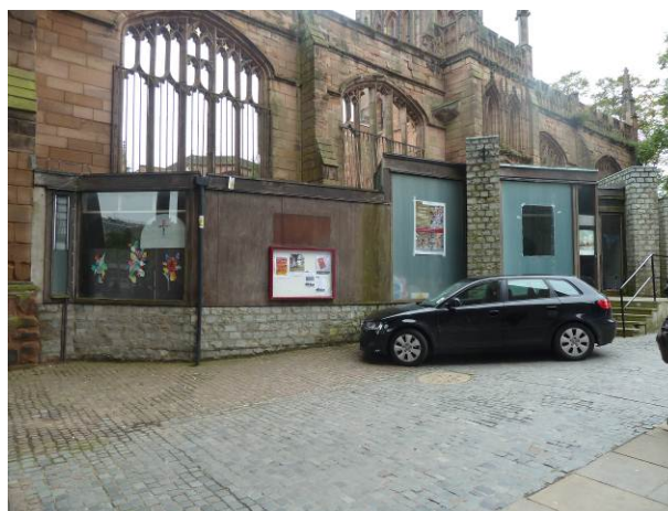
The Cathedral book shop built against the north entrance of the listed cathedral ruins

Some buildings have been unsympathetically altered in ways that detract from their character and appearance.