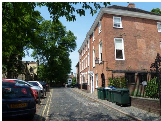
Wheelie bins in Priory Row