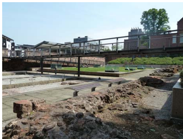
Undesignated remains of the medieval cathedral Church in Priory Gardens

The Conservation Area contains several buildings/structures that are of historical, archaeological or architectural significance but which are currently undesignated like the medieval Priory undercrofts.