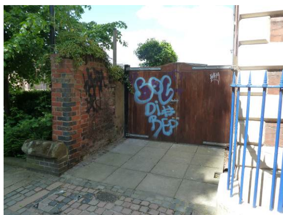
Graffiti adjacent to 6 Priory Row

Several boundary walls, gates and other structures have been affected by graffiti which detracts from the attractive views of historic buildings and streets and creates an atmosphere of neglect.