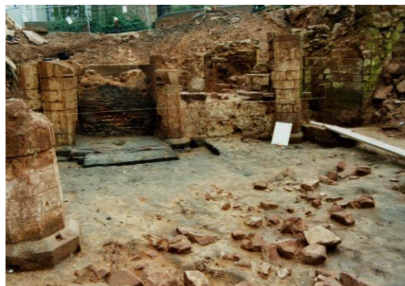
Priory Undercrofts under excavation

There is huge potential for archaeological remains within the Conservation Area, having been occupied for at least 1000 years, and the site of the medieval castle and Benedictine Priory.