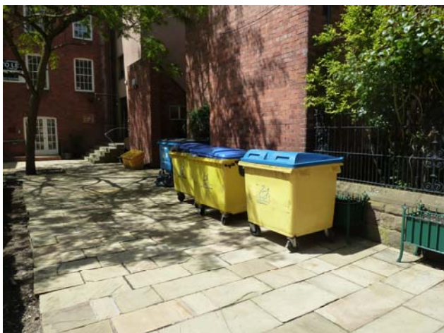
Refuse containers in Castle Yard

There are numerous places throughout the Conservation Area where large refuse containers and wheelie bins are left in prominent locations which have a detrimental impact on the character and appearance of the Conservation Area. Most premises have no dedicated storage place or if they do they do not use it. The array of bins and the accompanying nuisance of odours and insects spoil the appearance of Castle Yard and discourage people from using it.