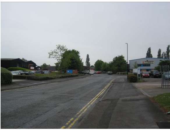
Typical industrial units in the Hotchkiss Lane area