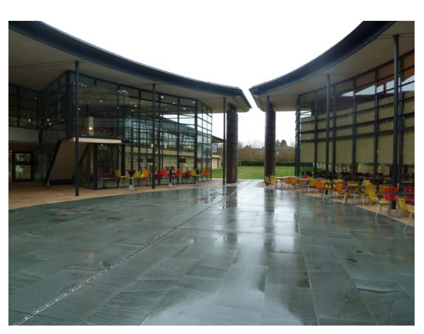
Network Rail Training College, Westwood Heath

The area remained predominantly agricultural until the end of the 20<sup>th</sup> Century/beginning of the 21<sup>st</sup> Century when a business park and residential development were built on much of the farmland. With the exception of a water course, which is the boundary of the northern edge of the business park, none of the development reflects the former field patterns.