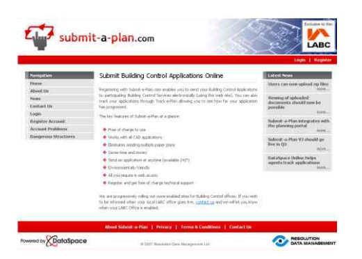
Screenshot from Submit-a-plan.com

Submit-a-Plan users can also track the progress of electronically submitted applications using the online management system.