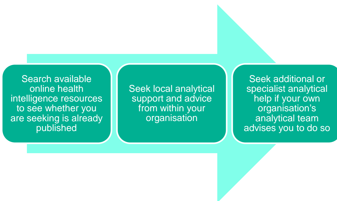
Figure 2. Three steps to accessing population health intelligence.

Generally there are three main steps to accessing health intelligence which are set out in Figure 2.