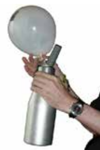
Image 3. Whipped cream dispenser