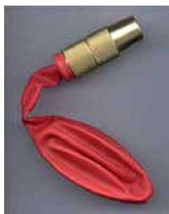
Image 2. Cracker with balloon attached