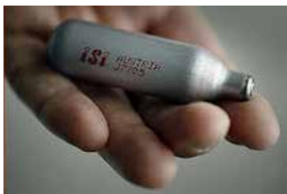
Image 1. Whippet

Appearance: At room temperature nitrous oxide is a colourless, non-flammable gas that is slightly sweet smelling and tasting. 1,6 Recreational users often get it from whipped cream chargers, sometimes called 'whippets', which are single-use, finger-length steel cartridges usually containing 8g of highly pressurised nitrous oxide (image 1), although 16g cartridges are also available. Nitrous oxide is also found in supermarket cans of whipped cream and full sized gas cylinders, intended for medical or industrial use.