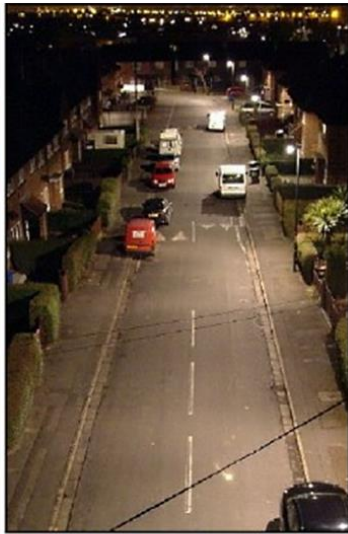
New Street Lighting