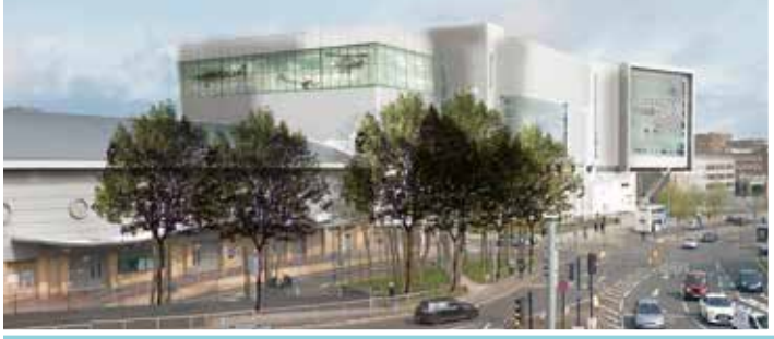
Pictured: Above, battery production could start at Coventry Airport in 2025. Below, IKEA building set to store nation's arts treasures.