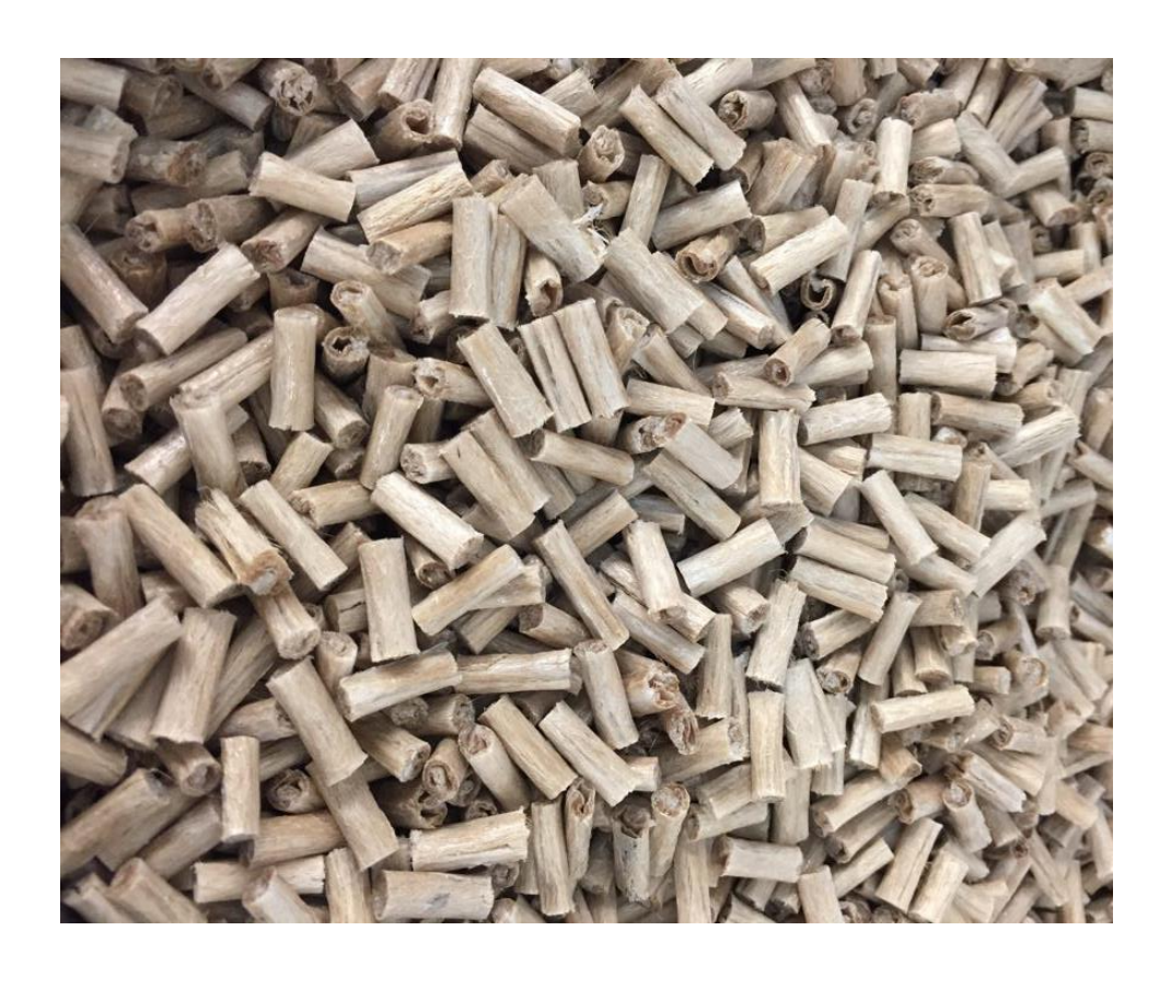
Natural Jute Fibres + Polypropylene Pellets