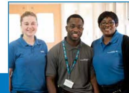
Amber Unit staff