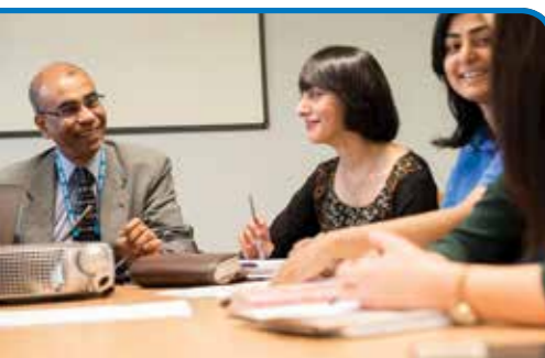
Some of the staff at Amber Unit

Using a multi-disciplinary approach informed by assessments, the team develop person-centred treatment plans based on a PBS framework. This supports the development of a needs led plan which can be translated into a community setting.