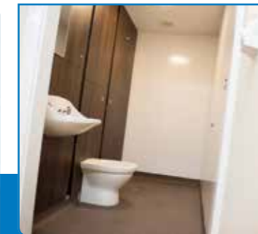
Exercise equipment, an enhanced care suite bedroom and bathroom

“The care staff and the nursing staff have been very re-assuring and hard working and we have developed very positive relationships and a sense of trust as parents.”