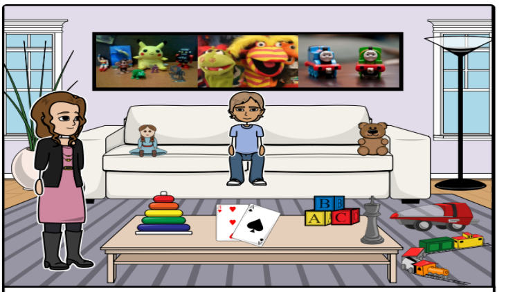
We have lots of toys for you to play with. We like playing with the toys too!