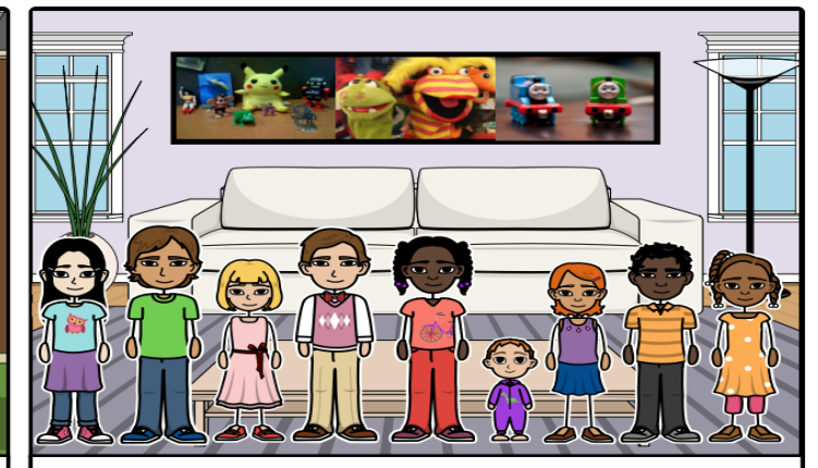
Lots of children visit our centre, and our job is to check that they are all OK.

You are visiting our centre because someone has told us that they are worried about you.