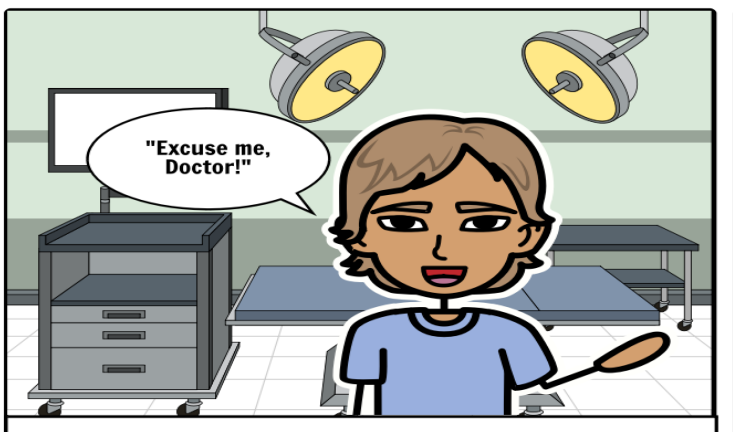
The check-up won't hurt at all. But, if you are not comfortable during the check-up, just let your Doctor know.

In this room, the Doctor will do a check-up on your body. They might use a special camera, and take some notes too.