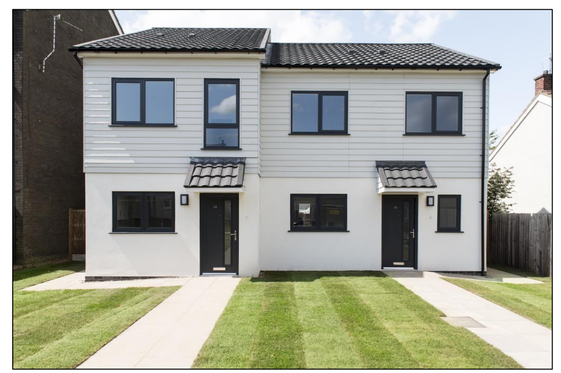
Modular housing delivered at Littlethorpe, Coventry by Citizen Housing

5.26 Affordable housing products are also being delivered via AMC within the wider West Midlands metropolitan area. Birmingham Municipal Housing Trust have initiated a programme in delivering affordable homes utilising modular methods that achieve a high level of sustainability and cost effectiveness that delivers homes of good quality, quickly.