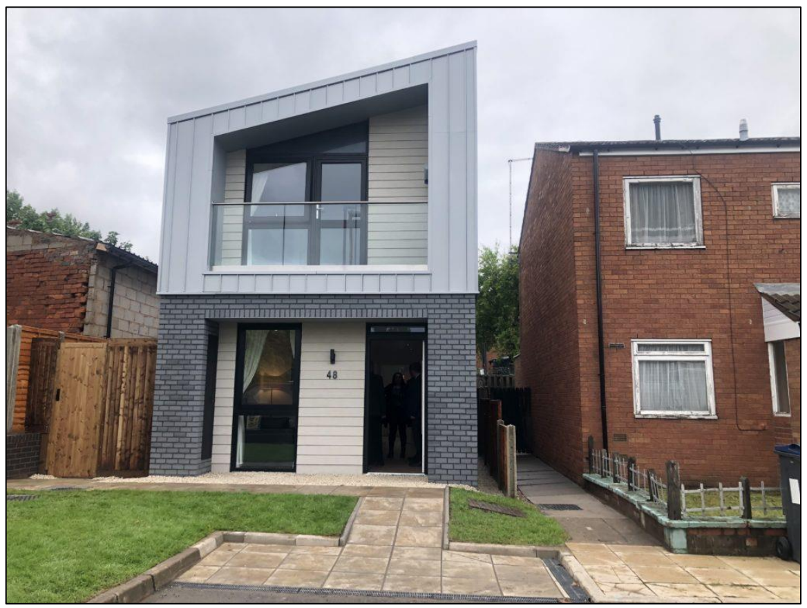
Modular affordable home delivered in Birmingham – image courtesy of Birmingham Municipal Housing Trust

5.27 Coventry City Council will encourage proposals to deliver affordable homes via Advanced Methods of Construction, particularly in cases where it can overcome viability issues and contribute towards achieving high performing, energy-efficient homes.