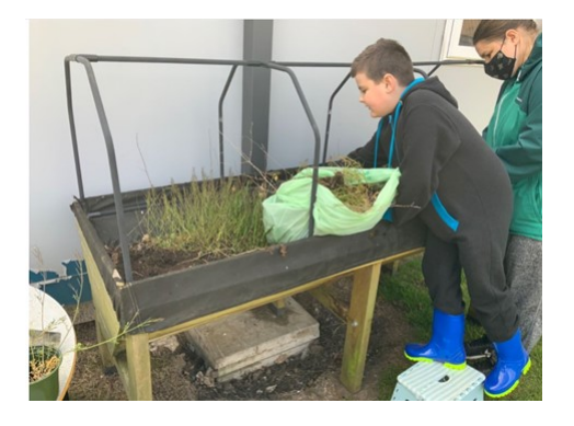
3. Sorting the school planter out.