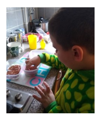
2. Planting them at home