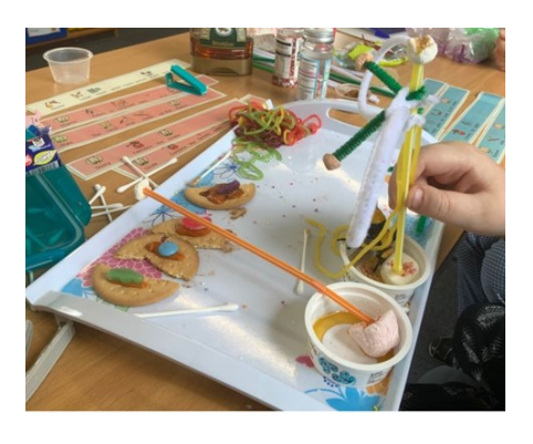
4. Learning about Pollination in school