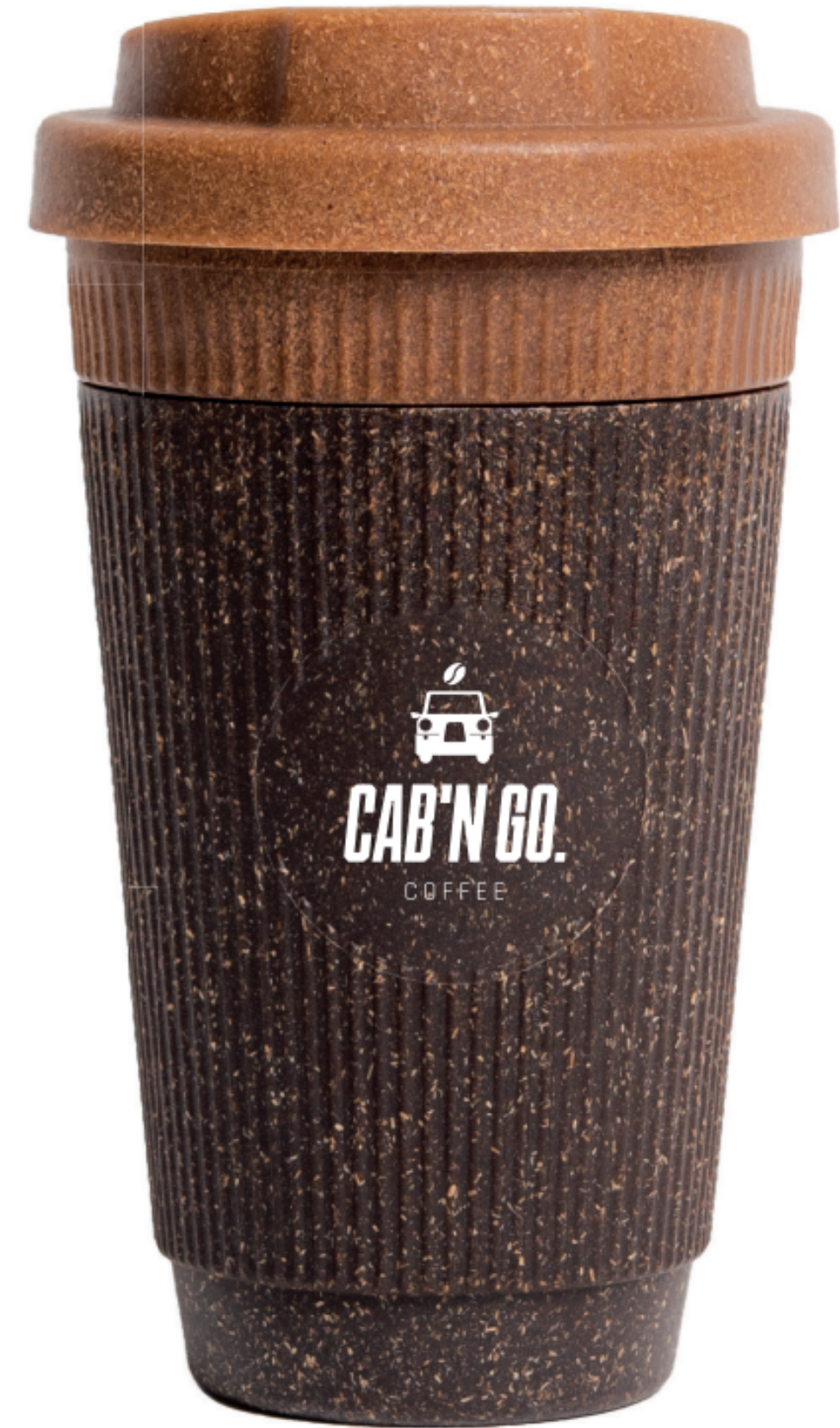
This cup is made out of coffee beans and wood.