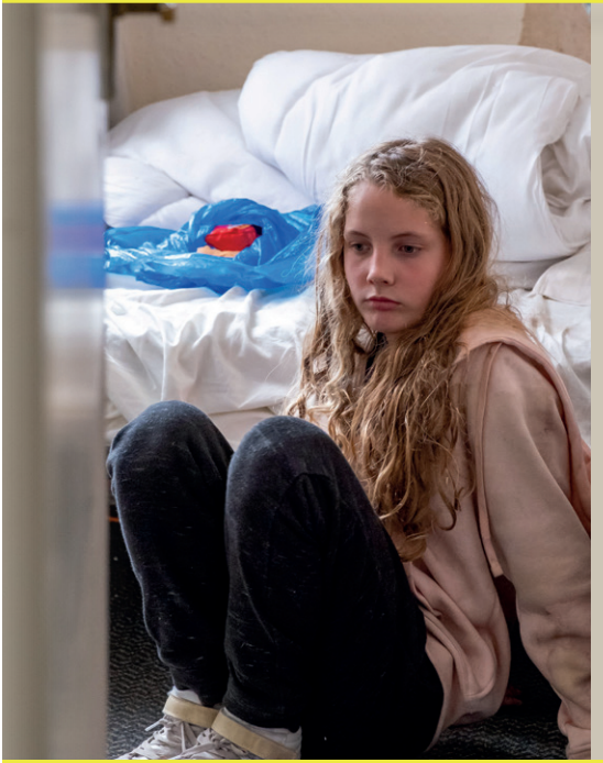
The film is now available to view at www.coventry.gov.uk/fostering