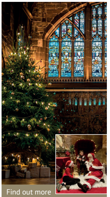
and book your tickets at www.stmarysguildhall.co.uk

St Mary's Guildhall, located in the city's historic Cathedral quarter, will be decorated with luxurious and opulent decorations, traditional greenery, and glittery lights along with two real 18ft Christmas trees to provide a Christmas card-worthy backdrop for visitors.