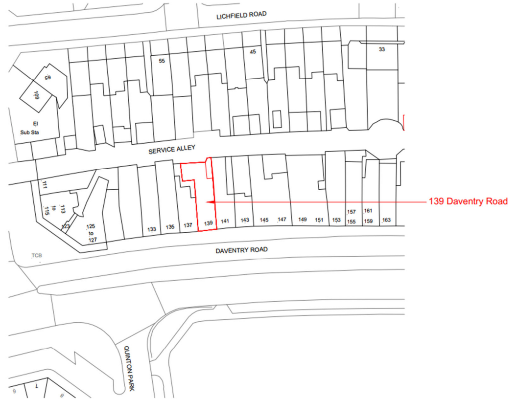
Location Plan Scale 1:500 @ A1.