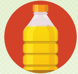
Oil or liquid fat