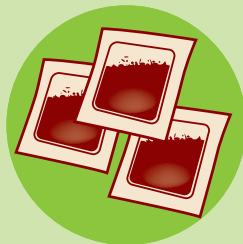
Tea bags and coffee grounds