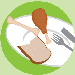
All uneaten food and plate scrapings