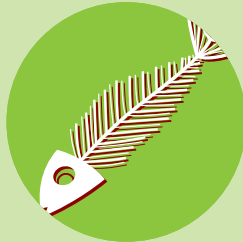
Raw and cooked meat and fish, including bones