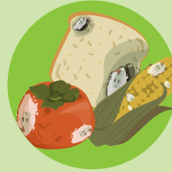
Mouldy, and out of date food