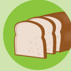
Bread, cakes and pastries