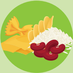
Rice, pasta and beans