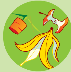
Raw and cooked vegetables and fruit, whole and peelings