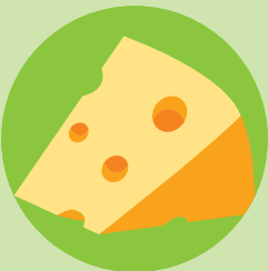
Dairy products, cheese and yoghurt